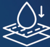
Reverse Osmosis Membrane

Reduces such contaminants as solids, arsenic, pharmaceuticals, and metals.