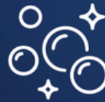
BIO-SURE PLUS Filter